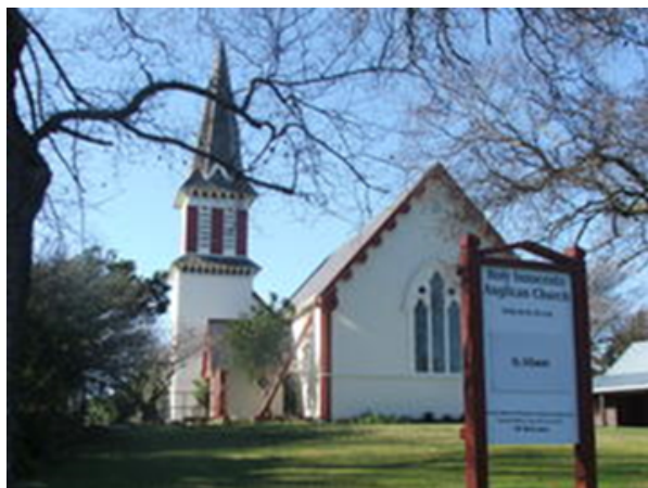
Holy Innocents Church Street, Amberley