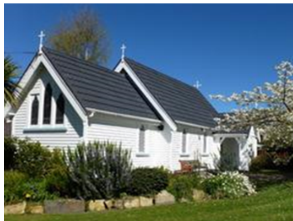
St Paul's Brighton Street, Leithfield